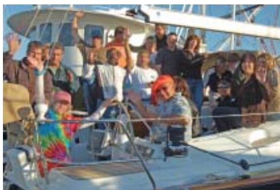
Half Moon Bay Cruisers

We hope that you're enjoying the ride as much as we are! We look forward to many more wonderful adventures to come!