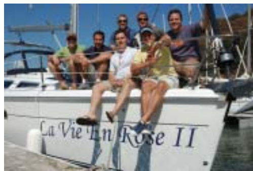
Charterers enjoy La Vie En Rose II

La Vie en Rose , a Hunter 36, joined the Sausalito fleet in August.