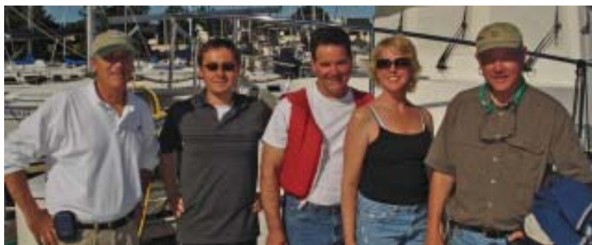
First US Powerboating Graduating Class with Instructor