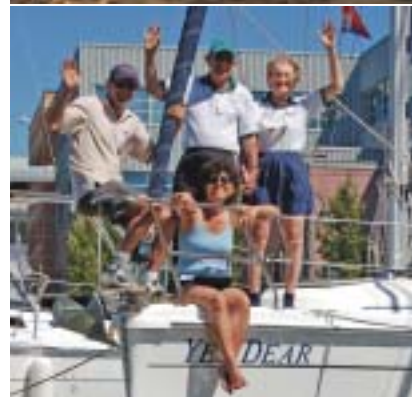
Top: Firefly -Hunter 36 Bottom: Yes Dear Hunter 31

updated as to the constant changes to the fleet in our weekly "Keeping You Current" emails (assuming, of course, that we have your email address).